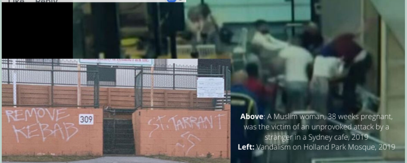
Above: A Muslim woman, 38 weeks pregnant, was the victim of an unprovoked attack by a stranger in a Sydney cafe, 2019